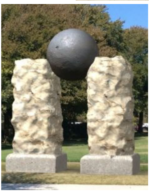
Rendering of the finished piece.