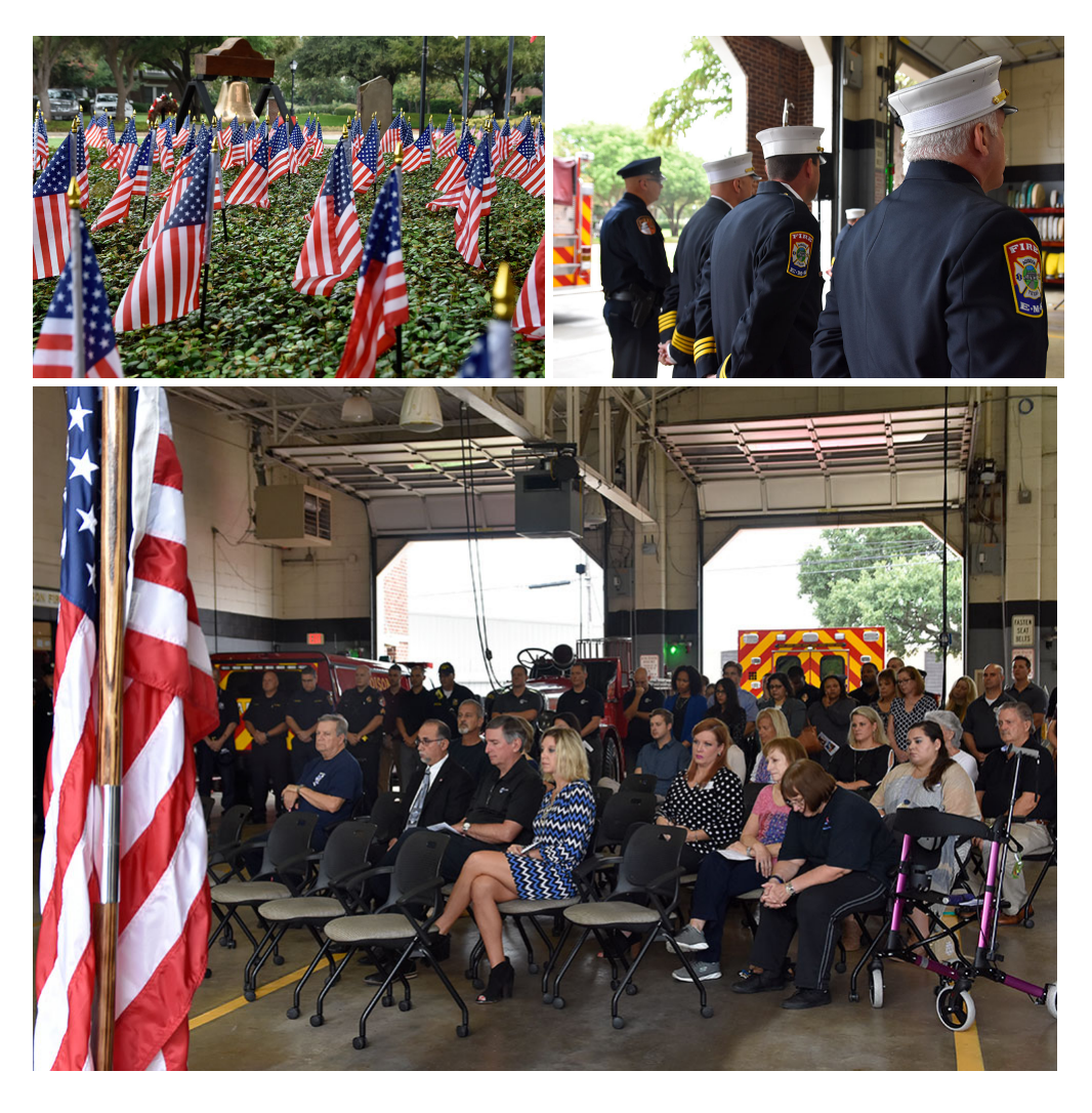
Tuesday, September 11 marked the 17th anniversary of the the tragic events that took place during a terrorist attack on the United States on September 11, 2001. The Addison Fire Department hosted a memorial at Fire Station 1, as it has for the past 16 years, to recognize the anniversary and honor the sacrifices made by our civilians and first responders that day. Many thanks to the AFD for helping us all to never forget.