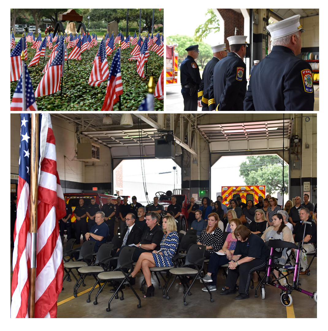
Tuesday, September 11 marked the 17th anniversary of the the tragic events that took place during a terrorist attack on the United States on September 11, 2001. The Addison Fire Department hosted a memorial at Fire Station 1, as it has for the past 16 years, to recognize the anniversary and honor the sacrifices made by our civilians and first responders that day. Many thanks to the AFD for helping us all to never forget.