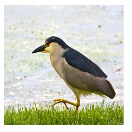
Herons left to right: Yellow-crowned Night Heron, Little Blue Heron, and Black-crowned Night Heron