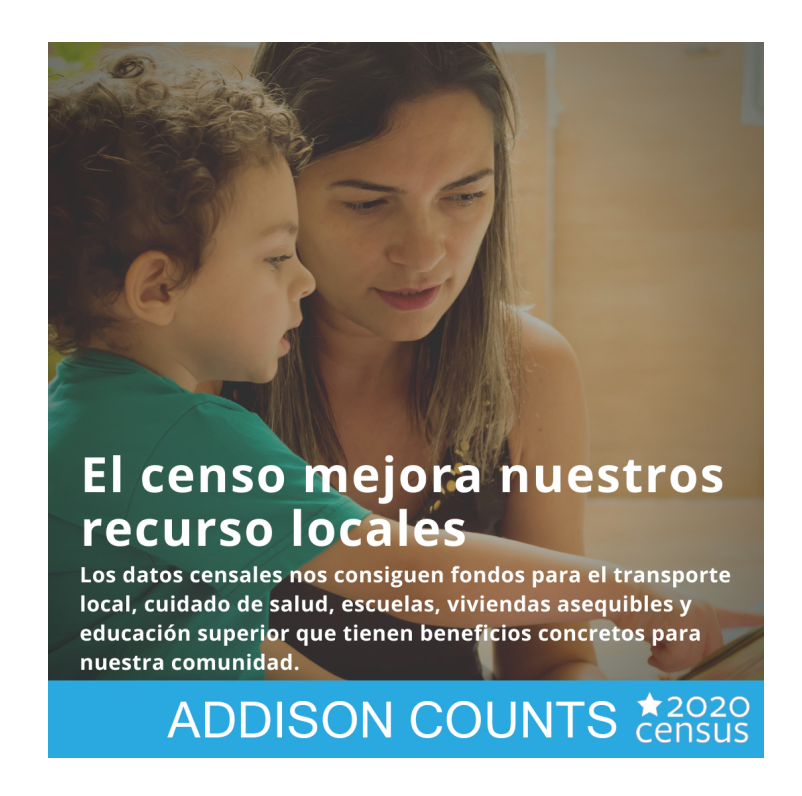
It's Not Too Late to Complete the 2020 Census!

You can find more information and FAQs at VisitAddison.com/drivein .