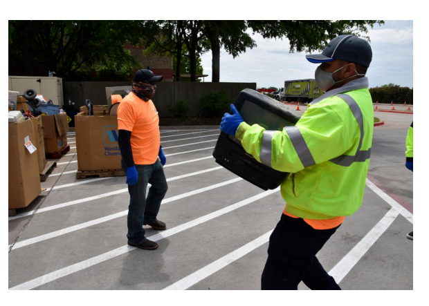
On April 17, Addison celebrated Earth Day and Sustainability Day with a contactless recycling event. Over a three-hour period, we had more than 150 cars drive through the Addison Service Center parking lot to drop off shredding, recyclables, and food donations for Metrocrest Services. We also gave away 50 tree saplings and nearly 100 t-shirts. Thank you to everyone who joined us.