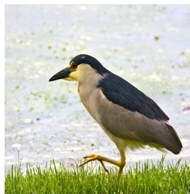
Hérons left to right: Yellow-crowned Night Heron, Little Blue Heron, and Black-crowned Night Heron