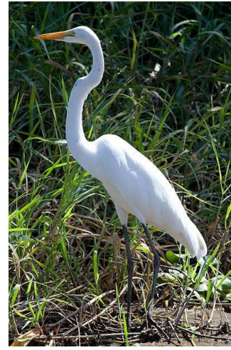
Egrets left to right: Cattle Egret, Snowy Egret, Great Egret

The Parks and Recreation Department is asking residents to help deter egrets and herons from forming nesting colonies (rookeries) in Addison. Urban rookeries can cause noise, odor, public health hazards, and damage to property. Residents can help by following these three simple steps: