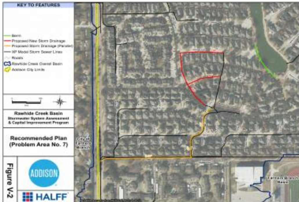
Figure 1 – Recommended Plan (Problem Area No. 7) for Rawhide Creek Basin

The Storm Drainage System Assessment and Capital Improvement Program prepared for the Town of Addison by Halff Associates in August 2017 identified improvements that are needed in the Rawhide Creek Drainage Basin. This project includes the design of drainage improvements along the residential streets of Waterside Court, Waterford Drive, Les Lacs Avenue, Beau Park Lane, and Brookwood Lane. The drainage improvements will follow the Brookwood Lane Connector to Les Lacs Linear Park Trail south from Brookwood Lane and run west along the linear park connecting to the existing storm drain system at Marsh Lane.