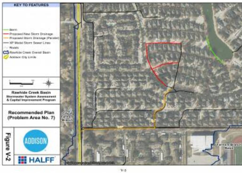
Figure 1 – Recommended Plan (Problem Area No. 7) for Rawhide Creek Basin

The Storm Drainage System Assessment and Capital Improvement Program prepared for the Town of Addison by Halff Associates in August 2017 identified improvements that are needed in the Rawhide Creek Drainage Basin. This project includes the design of drainage improvements along the residential streets of Waterside Court, Waterford Drive, Les Lacs Avenue, Beau Park Lane, and Brookwood Lane. The drainage improvements will follow the trail south from Brookwood Lane and run west along the linear park connecting to the existing storm drain system at Marsh Lane.