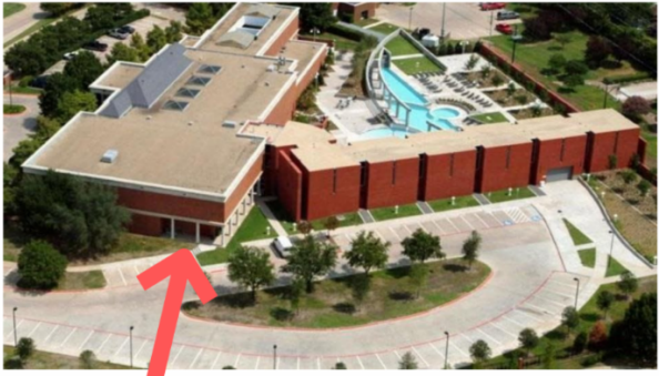
BASKETBALL GYM ENTRANCE

GROUP FITNESS PRICING: $75 for 3 months of unlimited classes $40 punch pass for 15 classes $4 drop-in fee to take one class. Senior discounts will be applied for anyone over the age of fifty.